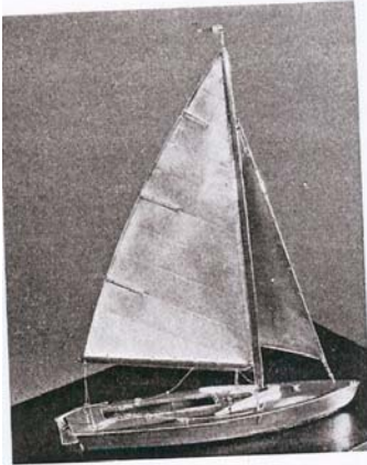
This trophy will be emblematic of the Lake Mohawk fleet championship

There will be no changes in the plans or restrictions unless it is toward making the requirements even closer to the design. The small, working jib has been dropped altogether and a price limit of $50 set on the Genoa jib and mainsail. No sails can cost more. The point scoring system has been slightly improved by giving a bonus of ten points for every race finished. The minimum number of races required shall be 5 and a maximum number has been set at 15. This bonus system should make for more races for the class. A few typographical errors will be corrected and that's about all there is to it.