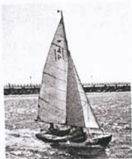
Ralph Spurrell's Olita series winner at Cabrillo Beach W. C. Sawyer