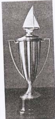
The Mayer Perpetual Trophy which will be raced for by the new Rochester fleet